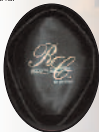
Example of Roberto Lining